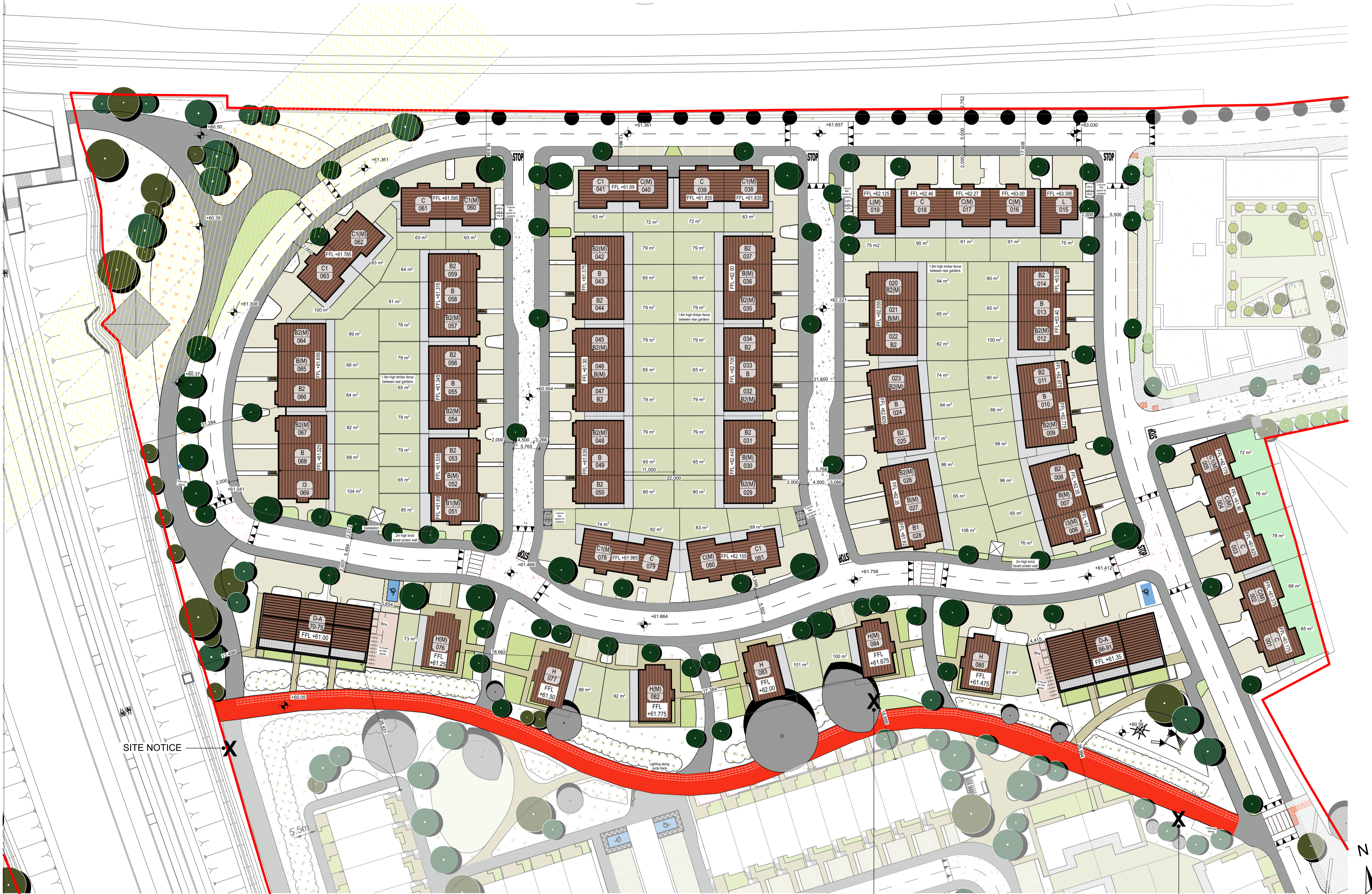
1:500 SITE LAYOUT